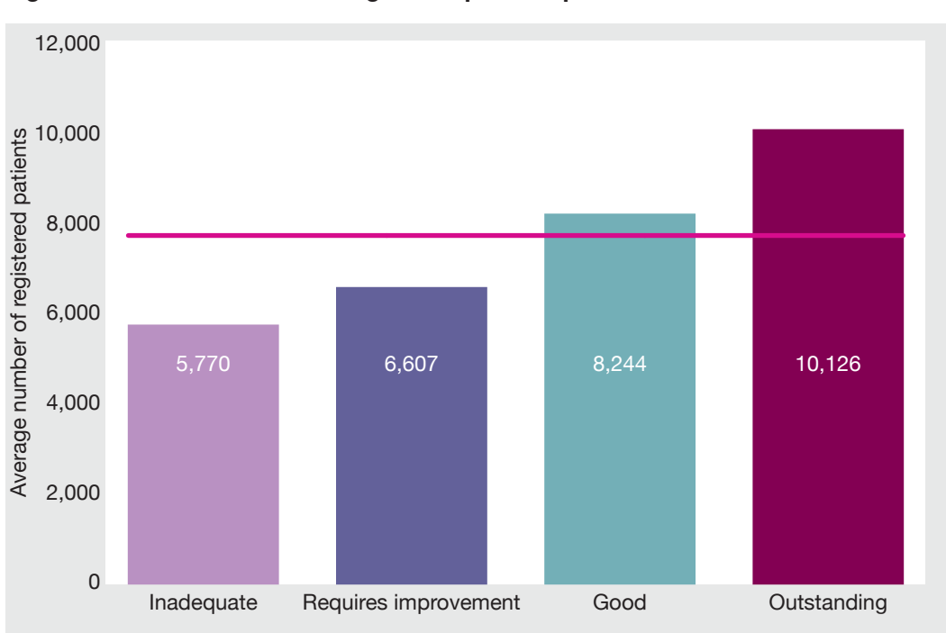
Figure 1: Practices with more registered patients perform better

The future of primary care is larger GP practices. A recent Care Quality Commission (CQC) report found a correlation between list sizes and CQC ratings (see Figure 1).<sup>5</sup>