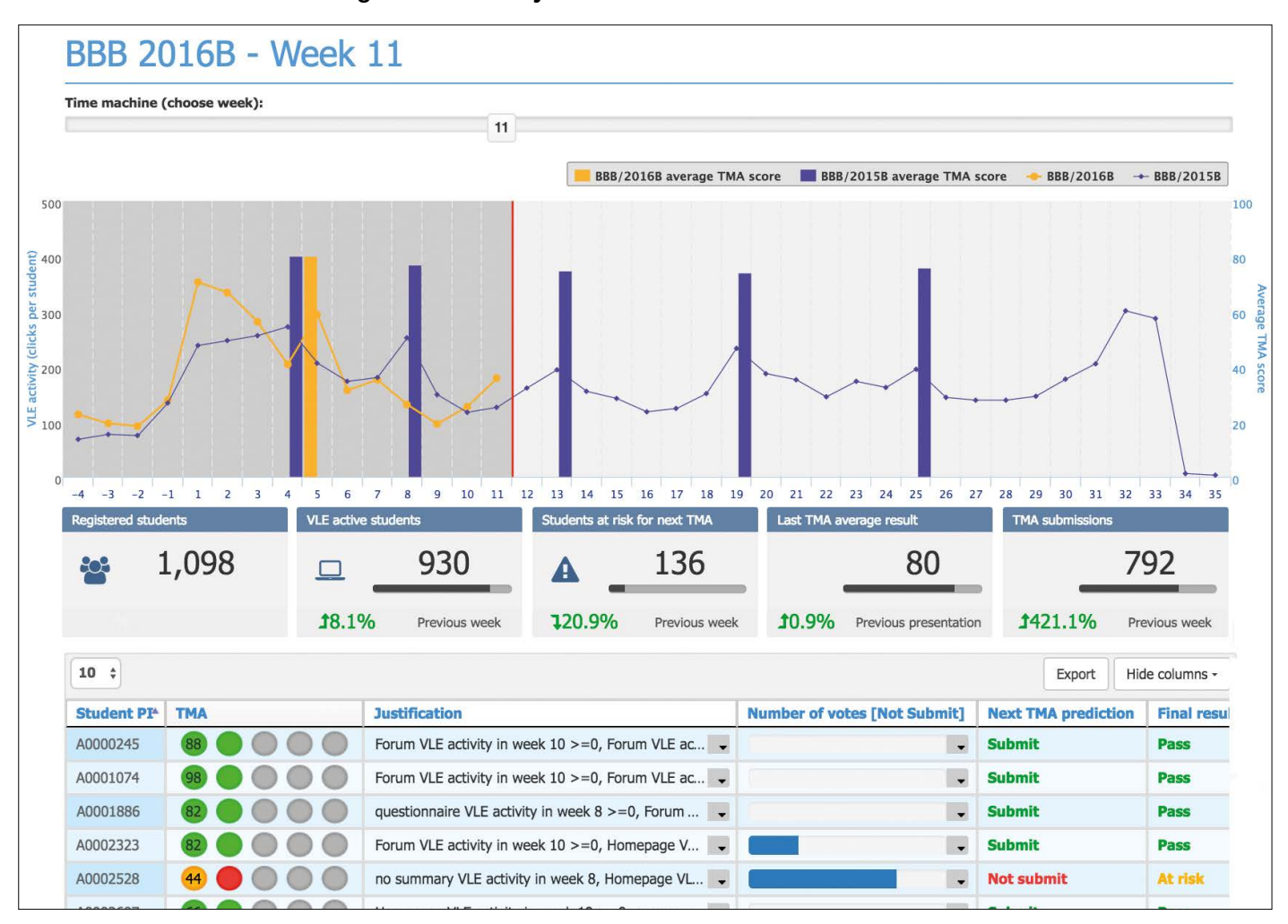
Figure 2: OU Analyse dashboard